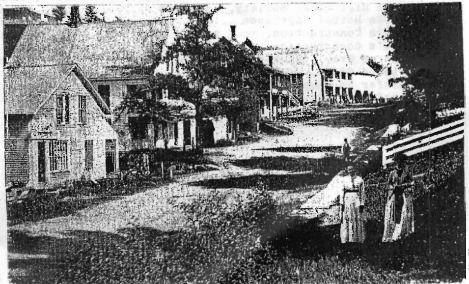
West Charleston Village looking south Before 1924

Publication-"Water-Quality Monitoring Program Overview and Summary of Initial Results NorthWoods Stewardship Center-Ecosystem Management Project 2004" - NorthWoods Stewardship Center.