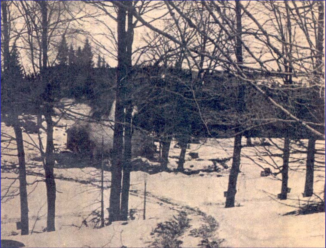
Maple Sugaring – Steam rising from the Lyndol Ames’ sugarhouse indicates he is boiling.